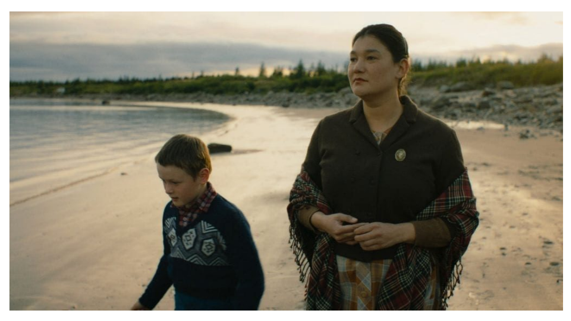
From Restless River, Courtesy of Arnait Video Productions and Isuma Distribution International