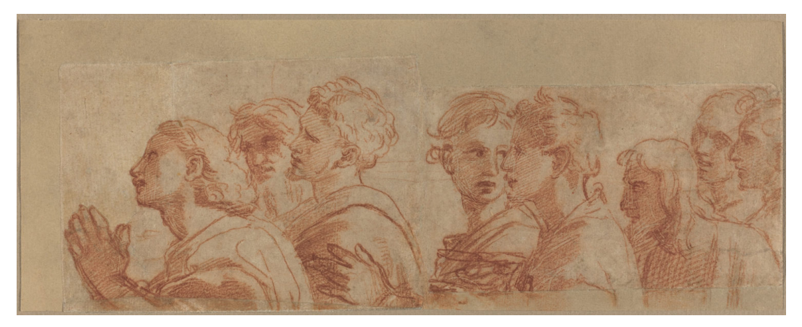
Rafael, Eight Apostles, c. 1514. National Gallery of Art, Washington, Woodner Collection