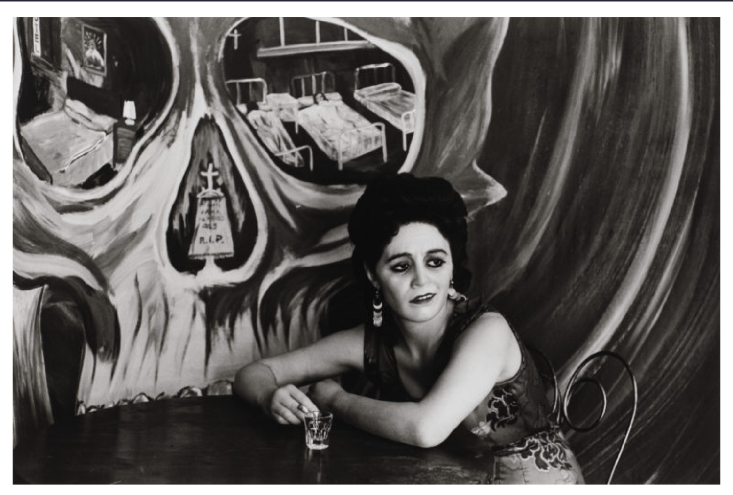
Graciela Iturbide, "Mexico City" Courtesy Museum of Fine Arts, Boston