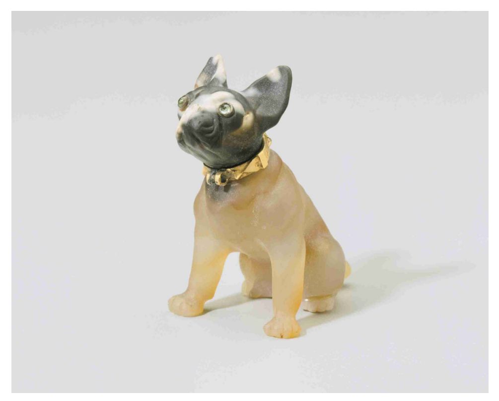
Figurine of a French Bulldog. Russia, ca. 1900.

historical and political context. (Disclaimer: American University holds the license for DCist's parent company, WAMU.) Feb. 15, 3 p.m. at the American University Museum at the Katzen Arts Center. FREE.